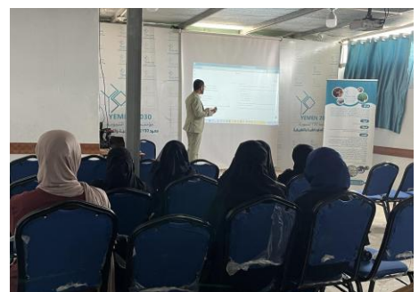
Artificial Intelligence Workshop