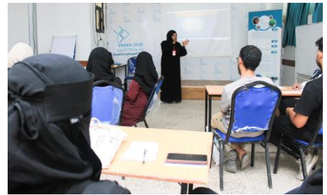
Training of Trainers (ToT) program for staff development.