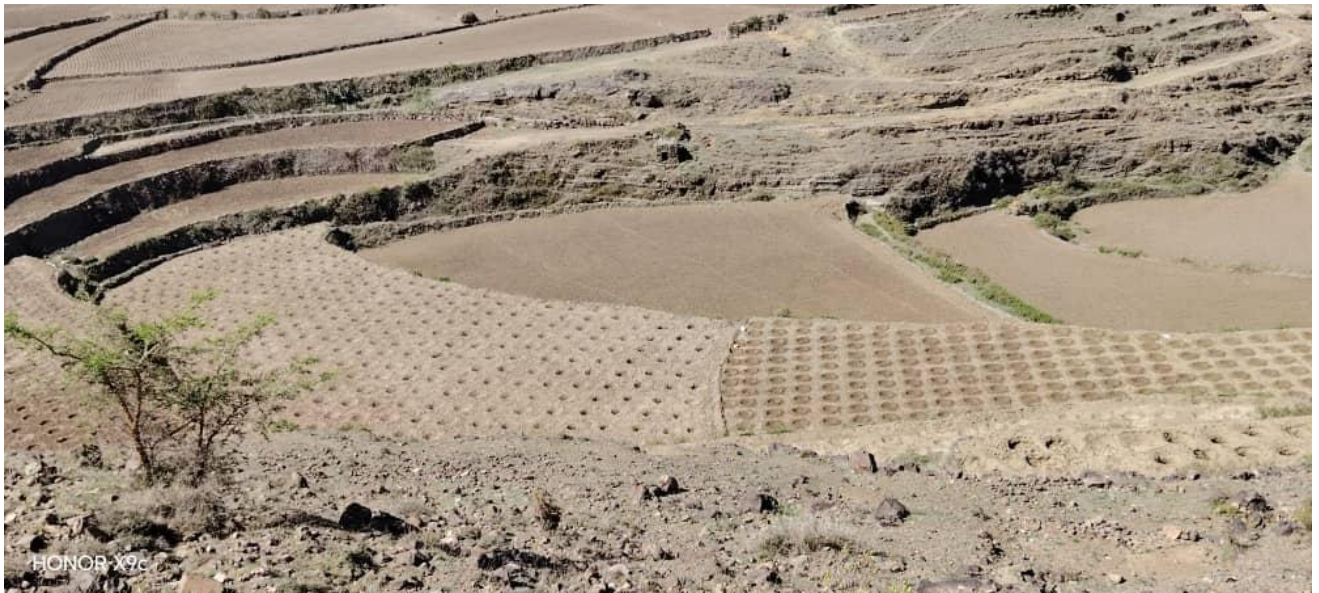
Preparing individual planting sites

Despite water shortages and budgetary constraints – with only 53% of the required budget secured this year – the project managed to maintain high implementation standards through the use of hardy seedlings, training for farmers and supervision of the plantations, resulting in high survival rates and sustainable outcomes.