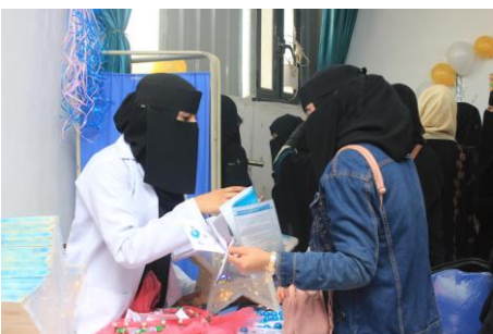
Safe Motherhood Awareness Seminar for Medical Students