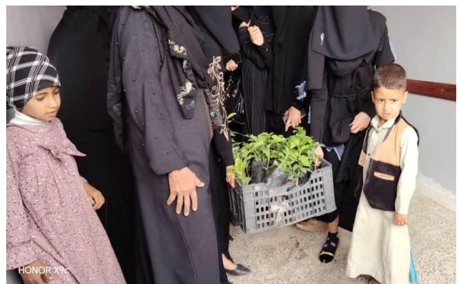
Distribution of coffee seedlings to project beneficiaries in Manakhah

By transforming the land and people's livelihoods, the 'Nurseries of Hope' project helps communities build a more sustainable future, based on resilience, opportunity and long-term growth.