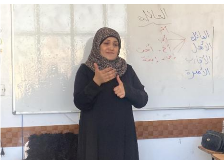
Sign language training course