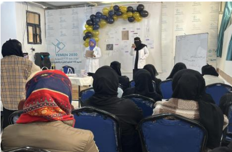
Medical students celebrate International Arabic Language Day