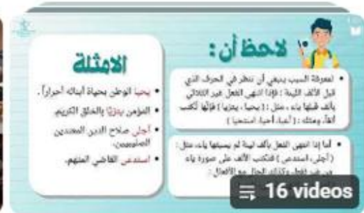
الكتاب 6 - القواعد النحوية والإملائية